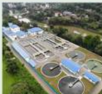
TEMPLE OF TOOTH RELIC | UOP | KCC | KCWWTP

Be a part of this conference to transfer climate resilience practices and expertise among the water utilities and learn & share knowledge on the latest technology, services and other developments that will shape the future of the sustainable water sector in the region..!