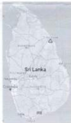
Figure 1. Location of Trincomalee

This tank farm had consisted of 100 nos. of identical steel storage tanks (Diameter- 35.0 M, Height- 14.5 M) constructed by the British Government during World War II (1920 to 1930) to facilitate their strategic fuel requirements. The working capacity of each tank is 10,000 MT of Furnace Oil. The entire tank farm had been designed and constructed with the storage capacity of one million metric tons, with one tank that was destroyed during the war.