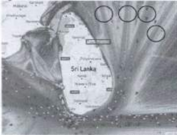
Figure 3 - Trades Routes closer to Sri Lanka

Evaluation of global trade flows and vessel movement analysis indicate that there is a high potential to attract oil majors and oil suppliers to store their products in the tank farm at Trincomalee.