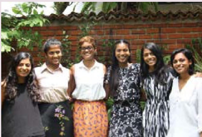
2016 Fellow Group Photograph

Women's Livelihoods in Post-war Sri Lanka," which focused on women's post-war livelihood outcome factors. When I returned to the states, I moved to New York and joined the NGO Working Group on Women, Peace, and Security as a Policy Research Fellow. Currently, I am working as a Graduate Research Assistant at Columbia University, where I completed an MA in Political Science; my own research at Columbia focused on factors that cause variation in the use of state-sponsored violence during intrastate conflicts. My personal and professional experiences within the LankaCorps Fellowship program transformed the direction of my career and continues to influence my commitment to human rights and social justice today. The other 2016 fellows became some of my family and closest friends during and after the program; everyday, they continue to teach me to be a more critical, empathetic, and tenacious person.