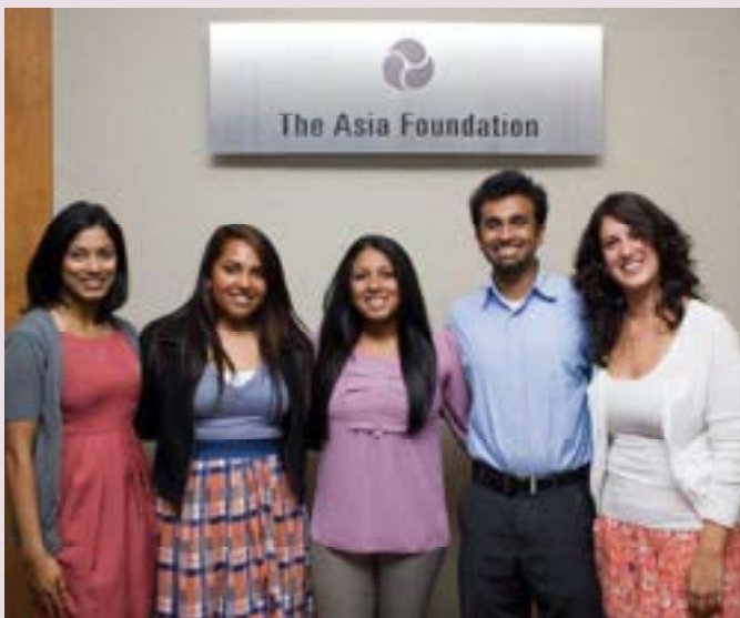
2012 Fellow Group Photograph

resiliency projects focused on water quality and flood management for cities. My LankaCorps placement at the National Water Supply and Drainage Board in Colombo was a great foundation to learn about policy, government, and infrastructure in Sri Lanka, and strongly influenced the direction of my postgraduate studies and career. Through LankaCorps, I also developed a more nuanced sense of identity, history and culture, especially in connecting to my family's ancestral home in Jaffna. Our cohort is still close, and our friendship is one the things I value most about the LankaCorps programme.