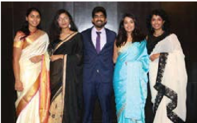
2019 Fellow Group Photograph