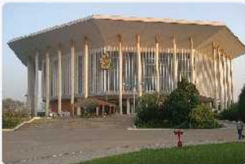
Bandaranayake Memorial International Conference Hall ( BMICH )