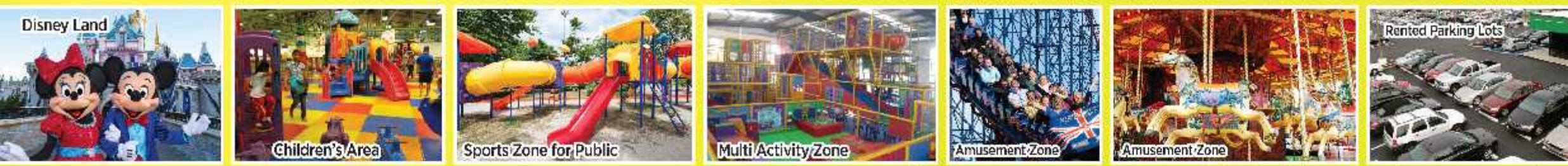
**All Pictures shown are for reference purpose only. Actual product may vary due to product enhancement.

Improve the sensation of health and happiness of people through the accessibility and quality of the green infrastructure (natural resources and recreational facilities) in Diyatha Uyana and to enhance the sensitiveness of the environment by the development activities.